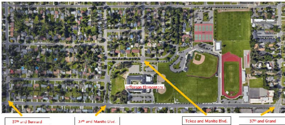
Jefferson Elementary School Adult Monitored Safety Patrol Crossings